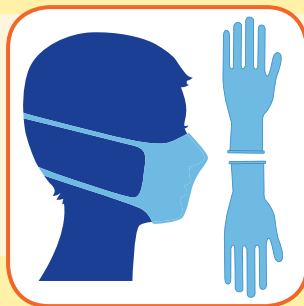
Use Personal Protective Equipment