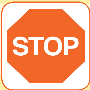
Follow all Posted Precaution Signs