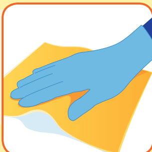
Keep Resident's Environment and Equipment Clean