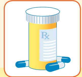
Know If Antibiotics are Appropriate