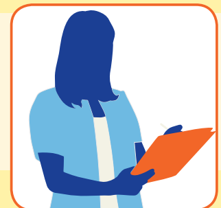
Educate Residents on Infection Prevention

Know Your Facility's Infection Preventionist: