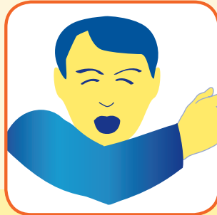
Stay Home if You're Sick